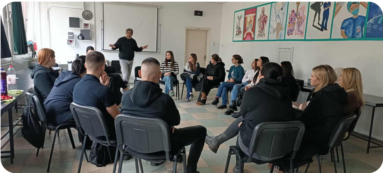
Photographs: Workshop with young people – Public Institution Middle Medical School Tuzla - December 2025

21 young people (13 girls and 8 boys) were directly involved in the project, while more than 300 people were indirectly involved through sharing of acquired information among peers. The Association has been working for years to promote Roma culture and to preserve identity, which contributes to the wider reach of these activities.