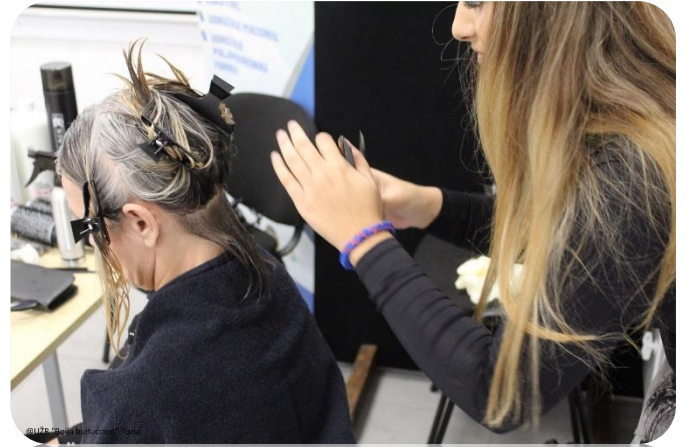
Photographs: Workshop in the Kiseljak Community Center held on January 10, 2025.