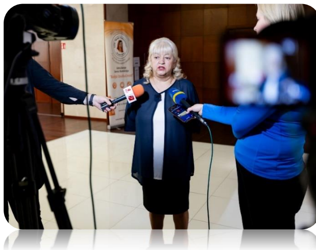
Photograph: National Roundtable, "Transformative Education: Empowering Marginalized Women and Girls for a Better Future"; October 2025