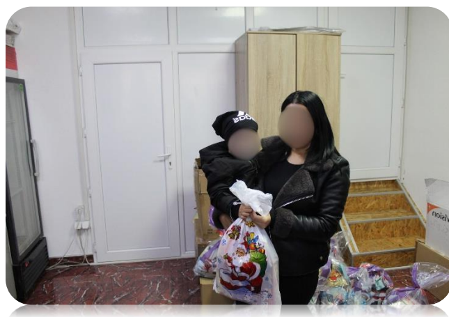
Photograph: Distribution of New Year's packages to beneficiaries

This activity brought joy and holiday spirit to the children, and allowed them to feel the attention, support and warmth of the community. Our goal is to provide them with moments of happiness and support families for whom this type of help means a lot.