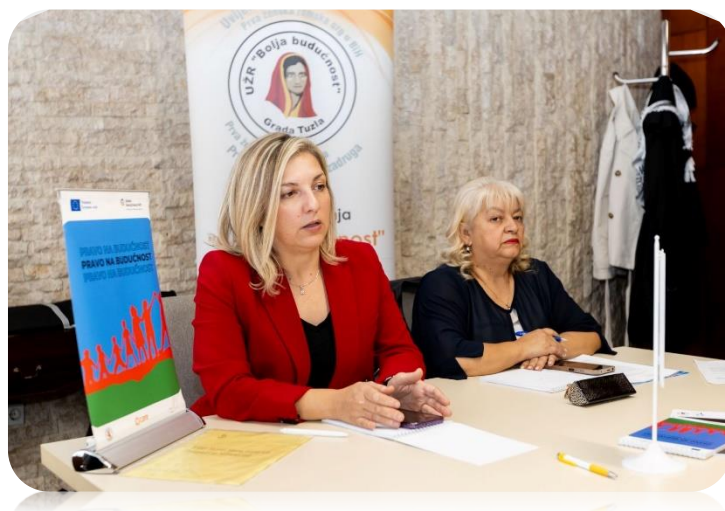
Photograph: National Roundtable, "Transformative Education: Empowering Marginalized Women and Girls for a Better Future"; October 2025

The roundtable brought together human rights experts, representatives of non-governmental organizations, institutions and decision-makers to jointly improve the prevention and fight against human trafficking in Roma communities. 25 representatives of relevant ministries at the cantonal level, the Center for Social Work, the police administration, and representatives of non-governmental organizations operating in the Tuzla Canton participated. A special focus was on education as a preventive factor, with an emphasis on the development of Roma students, especially Roma girls.