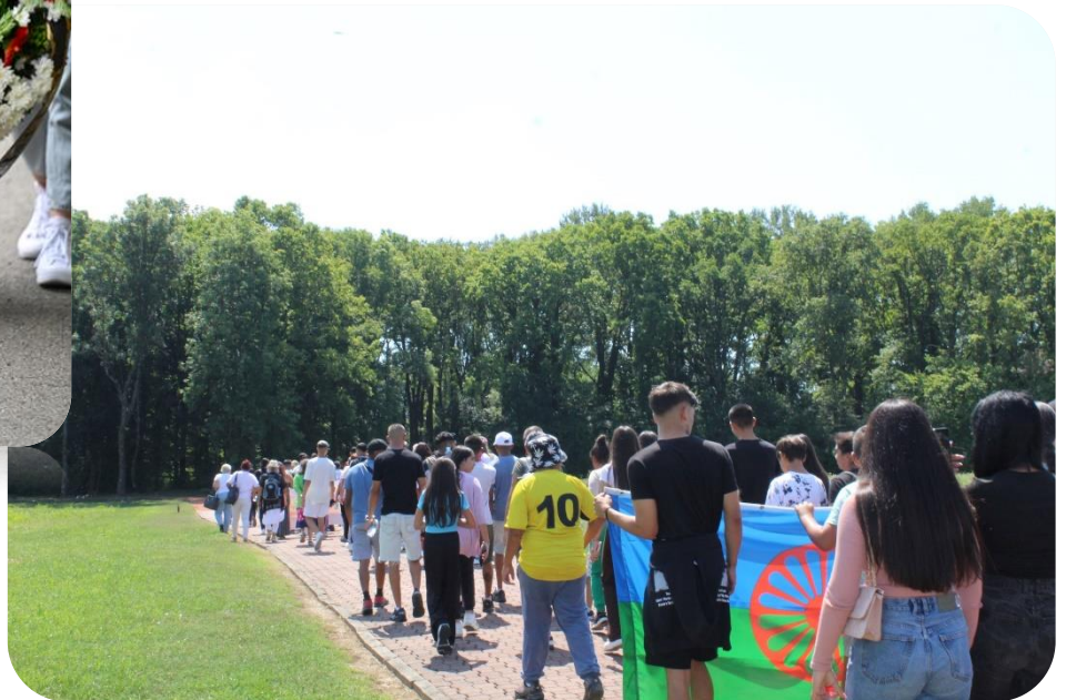
Photograph: Commemoration in Donja Gradina 2025

In previous years, we have visited other important places of remembrance, such as Auschwitz and Uštica, while this year we continued the tradition of visiting Donja Gradina, which we have been doing for 13 years. Representatives of our Association also attended the commemoration in Uštica, Republic of Croatia.