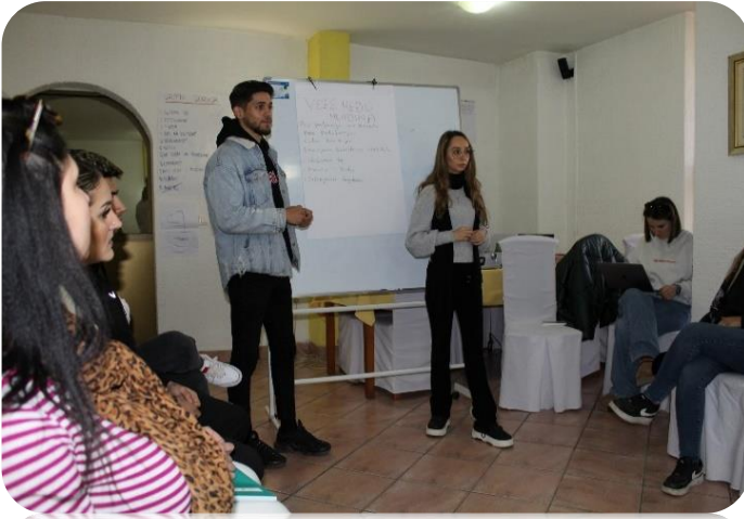
Photograph: Training for peer educators