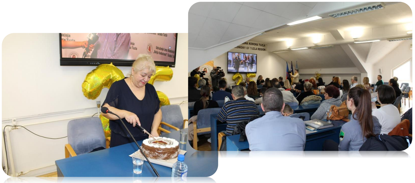
Photographs: 25 years of dedication, effort and action for a better tomorrow!

We continue to build a better future together!