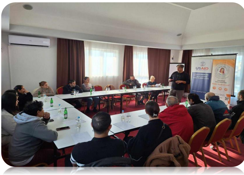
Photograph: Travnik 16.01.2025. One of the workshops dedicated to strengthening the Roma community in the fight against human trafficking

Activities were suspended following the decision of US President Donald Trump to suspend all forms of US foreign aid. After the suspension of project activities, thanks to our advocacy activities and our partner organization „Zemlja djece in BiH“, MIT teams were formed in Kakanj, Travnik and Donji Vakuf, and we expect them to be formed in Sanski Most as well.