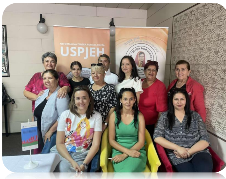
Photograph: Members of the Roma Women's Network "Uspjeh" – July 2025, Sarajevo

With this work, the Roma Women's Network "Uspjeh" was further strengthened and positioned as a relevant factor in the field of gender equality and the rights of Roma women in BiH in 2025.