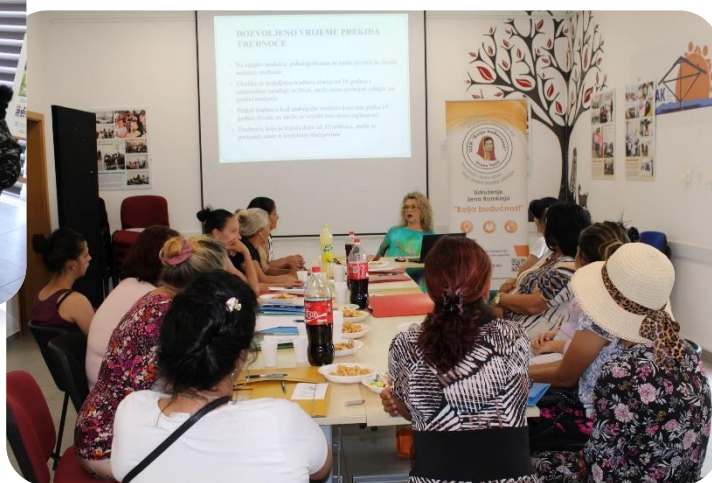
Photograph on the right: Workshop "Improving Sexual Health and Family Planning" held on June 9, 2025 at the Kiseljak Community Center