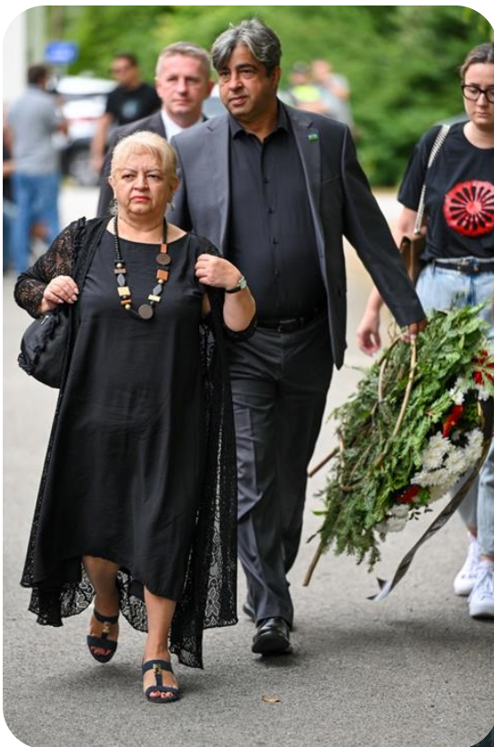
Commemoration in Uštica, Republic of Croatia – August 2025

We organized a trip to Donja Gradina to honor the victims of the Holocaust - Samudaripen. We realized the visit together with members of the Women's Roma Network, our members and youth. During the visit, we visited the place of the suffering, and laid wreaths and flowers.