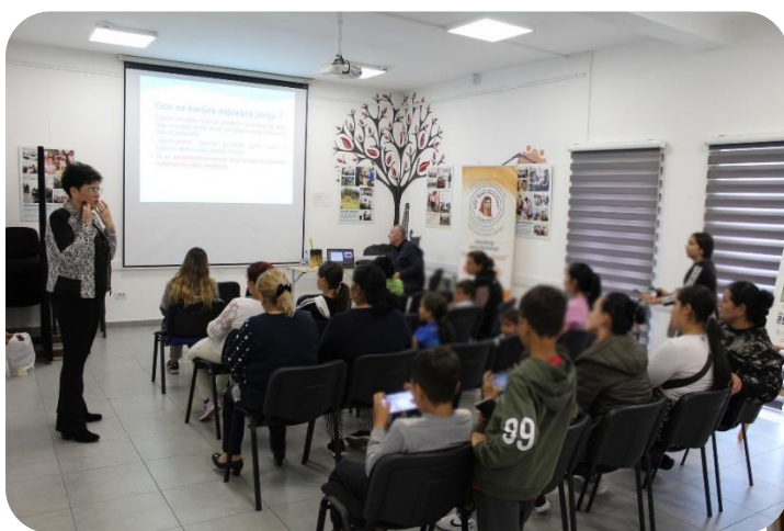
Photograph on the left: Oral health workshop held on May 19, 2025, in the Kiseljak Community Center

During 2025, the Association "Bolja budućnost" implemented a health support project for the Roma community in Tuzla, in close cooperation with the public Health Center Dr. Mustafa Šehović from the city of Tuzla. The aim of the project was to improve the health and hygiene conditions of the Roma population, and to increase awareness about the prevention of infectious and non-infectious diseases, oral health, and sexual and reproductive health.